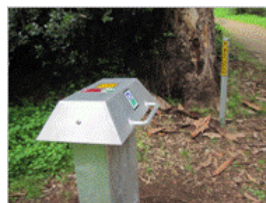
Dispenser capacity increased in Brock Reserve to accommodate Pioneer Womens Trail leaflets